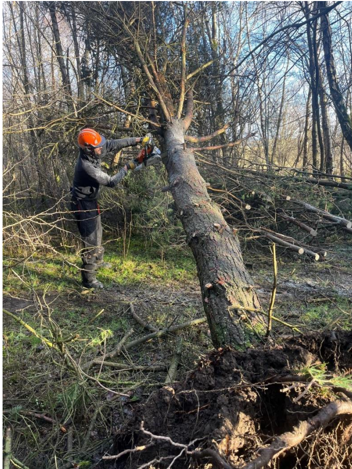
Chainsaw work in February after storm Eowyn brought down some mature trees.

In February, Lothian Conservation Volunteers put in a hard day's work clearing blackthorn from near the path.